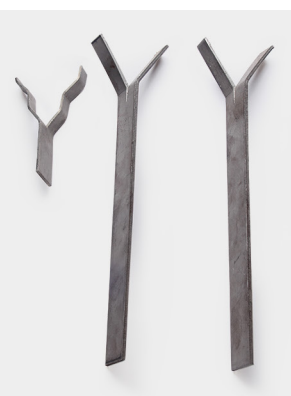
304# 310# 316# Split"Y" Anchors